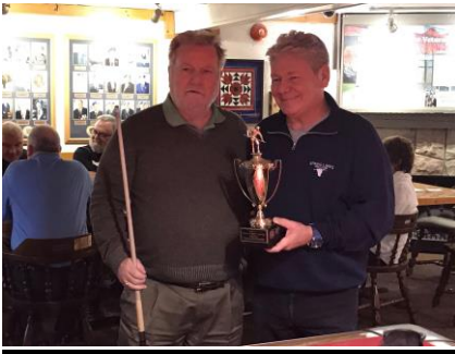
8-Ball Pool League Winners