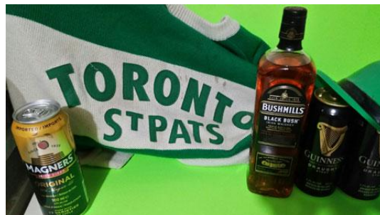
Happy Hour started at 4:00 pm for Jim Dibblee !