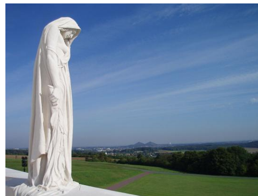
The Mourning Statue – also called “Mother Canada” looking over Douai Plain also known as “Hill 145”, Vimy Ridge

Vimy Ridge was a particularly important tactical feature of WW1. Its capture by the Canadians was essential to the advances by the British Third Army and of exceptional importance to checking the German attacks in the area in 1918. Unfortunately, we cannot gather to honour those that served and lost their lives during this important operation but let us take a moment on Friday to Remember them.