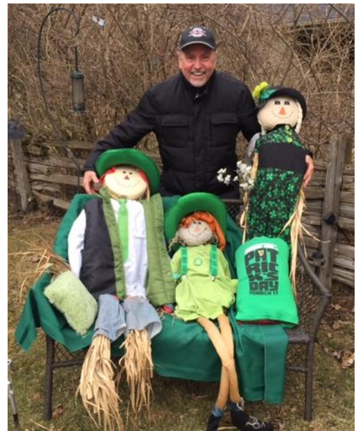
After 4:00 PM at the MDVA on St. Patrick's Day