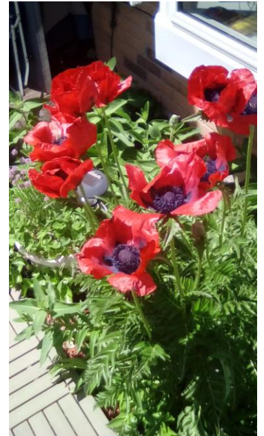
Photo of these poppies was submitted By Betty McInnes from Betty & Bobby's garden.