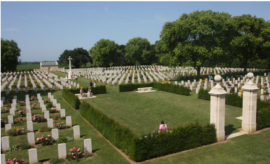
Image of one of the Canadian cemeteries' not far from Juno beach – taken in June of 2018