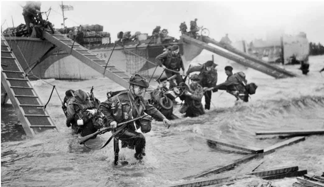
Image of Canadian landing at Juno Beach