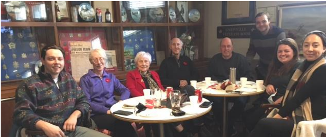
Back to the MDVA for light refreshments & fellowship ....